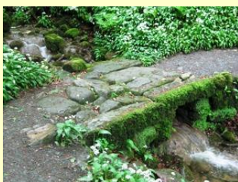
Stone slab bridge