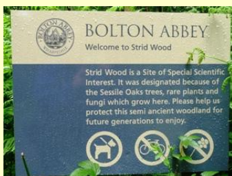
Welcome to Strid Wood