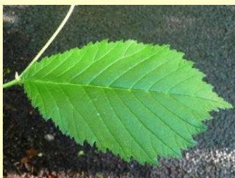
Wych Elm tree