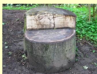
Tree stump seat