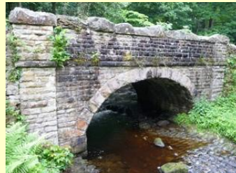
Stone bridge with one arch