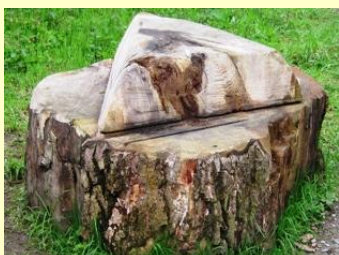
Triangle tree stump