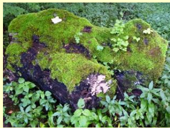
Mossy tree trunk