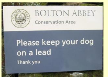
Sign for dogs