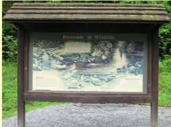
Riverside wildlife board