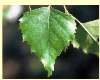
Silver birch tree