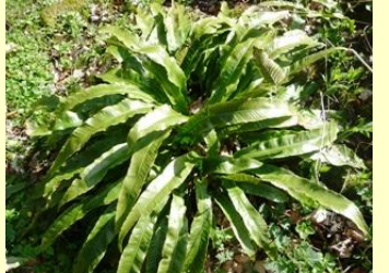
Hart's tongue fern